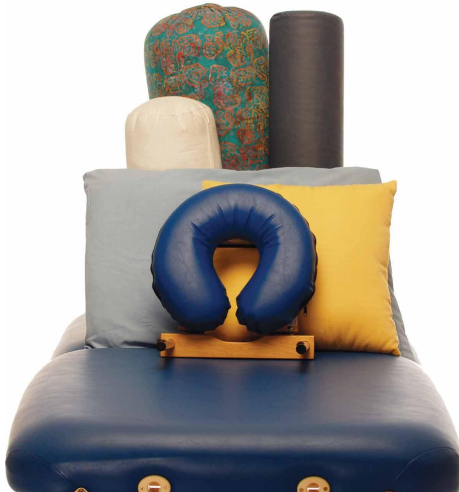
An Adjustable Face Cradle and a Variety of Pillows and Bolsters