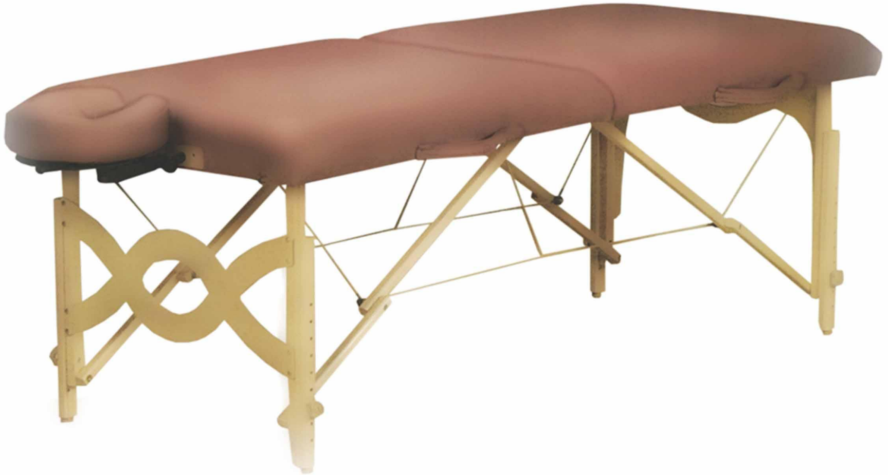
Adjustable Massage Table with Face Cradle